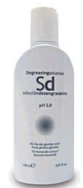
PRESENTATION 150 ml.