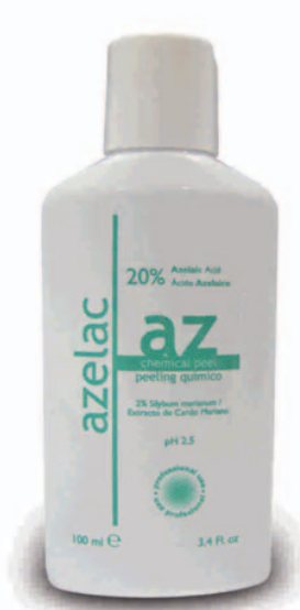
PRESENTATION 100 ml.

Silymarin is known for its antioxidant, anti-inflammatory and anti redness properties, which makes it useful in the treatment of rosacea and couperosis.