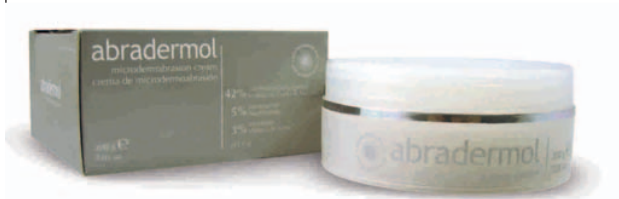
PRESENTATION 200 g