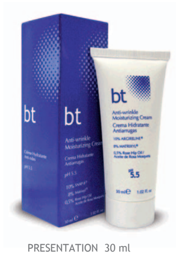
PRESENTATION 30 ml

Properties Light gel that is quickly absorbed and contains aloe vera, alpha-bisabolol, glycyrrhetic acid, rose hip oil, and natural plant extracts. Anti-inflammatory and anti-irritant action due to its content in mallow extract, chamomile, calendula extract, hamamelis, horse chestnut extract, linden extract and birch extract. It has antibacterial (aloe and triclosan), moisturizing, soothing, and refreshing properties. Stimulates and boosts cutaneous regeneration (aloe, allantoin and rose hip oil).