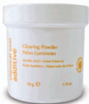
PRESENTATION 50 g.

Additives are products designed to be combined with chemical peelings, with the aim of contributing to the pure active ingredients to enhance the results of chemical peels.