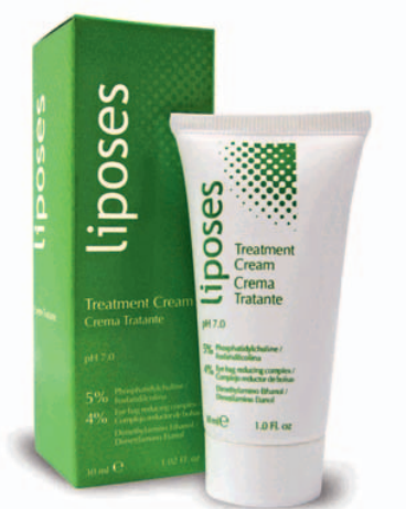
PRESENTATION 30 ml

It contains DMAE, a nutrient that fights the signs of aging skin instantly. It improves the shape and firmness of the face and the jaw area (reaffirming action). Stimulates muscle activity producing stretching with a lifting effect (tensing effect), increases skin elasticity, reduces wrinkles and stabilizes cell membranes to repair the damage caused by free radicals in collagen (antioxidant effect). Produces filler effect, more shaped lips.