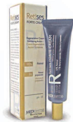
PRESENTATION Tube of 15ml

Apply 1 / 2 or 1 ampoule of Vitamin C and wait a few minutes. Apply a thin layer of the retinol cream on the area being treated. Let it work for about 8 hours. Wash the treated area.