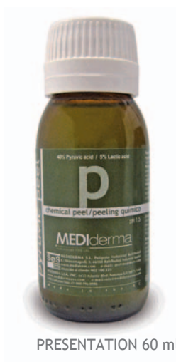
PRESENTATION 60 ml.

After implementation, it is normal for a mild erythema to appear, which will go away after a few hours.