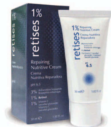
PRESENTATION Tube of 30 ml

Apply to the treatment area or specific lesion. Let it work for about 8 hours. Wash the treated area.