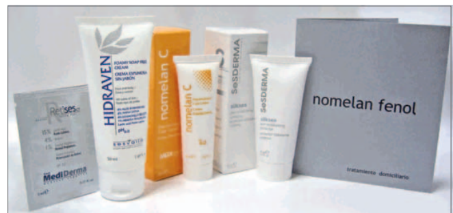
Home Pack Nomelan Fenol