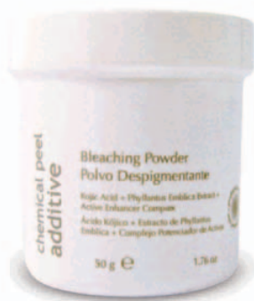
PRESENTATION 50 g.