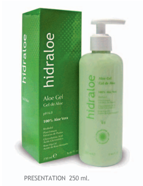
PRESENTATION 250 ml.