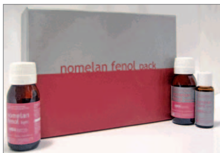
Nomelan Fenol Pack