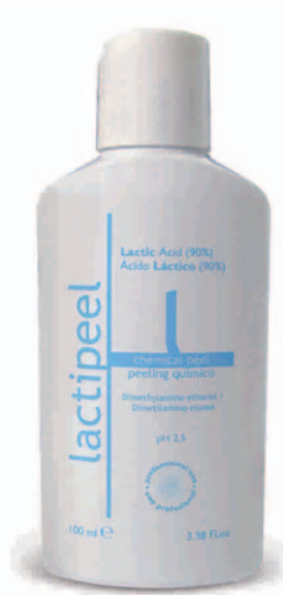
PRESENTATION 100 mL.

Formulated in a gel texture that makes the acid slowly penetrates the skin diminishing the irritation of the lactic acid.