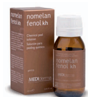
PRESENTATION 60 mL.

Indications Designed for localized applications.