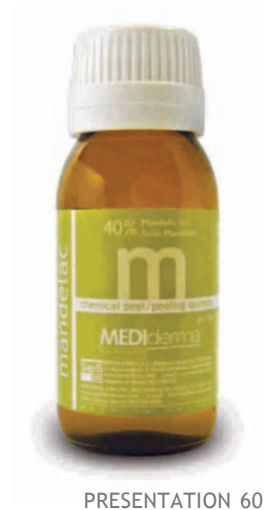
PRESENTATION 60 ml.