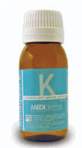
PRESENTATION 60 ml.