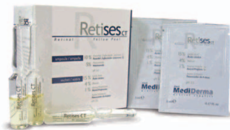
PRESENTATION 6 ampoules of 2ml 6 packs of 5ml

The chemical peel is combinable with other anti aging repairer or de-pigmentation treatments. (Chemical peels, laser, IPL ...).