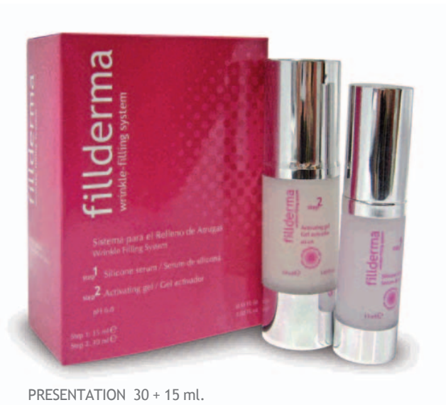
PRESENTATION 30 + 15 ml.

Rose clay mask which contains active ingredients with hydrating, smoothing, calming and repairing properties. Ideal after aggressive treatment ( chemical peels or microdermoabrasions) since it provides high level of AGEs for the skin, the vital constituents of the cell membranes, responsible for the skin regeneration action.