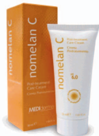
PRESENTATION 30 ml