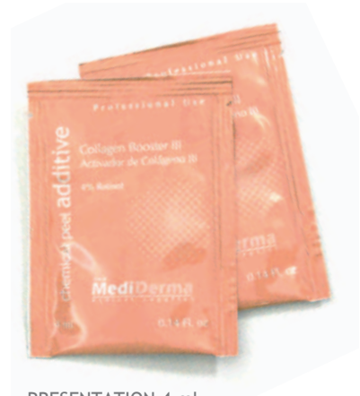
PRESENTATION 4 ml.

Palmitoil pentapeptide stimulates fibroblasts to synthesize molecules of connective tissue, specifically collagen, fibronectin and glycosaminoglycans. In this way it regenerates the dermal matrix, improves the firmness of the skin and reduces wrinkles.