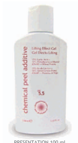
PRESENTATION 100 mL.