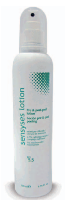
PRESENTATION 200 ml.

Tonic lotion with glycolic acid, moisturizing and astringents agents (water Hamamelis). Removes makeup residues that remain after the application of cleansing lotions. Notable degreasing action, useful in the cleaning and hygiene of greasy skin with a tendency to have impurities. Ideal for degreasing the facial skin that will be subjected to chemical peels and favouring the penetration of other agents that are usually used for wrinkles, acne and facial blemishes.