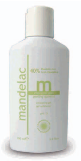
PRESENTATION 100 ml.