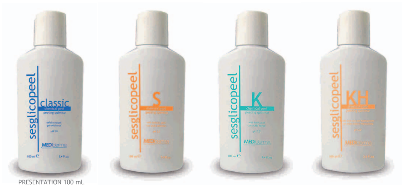
PRESENTATION 100 ml.