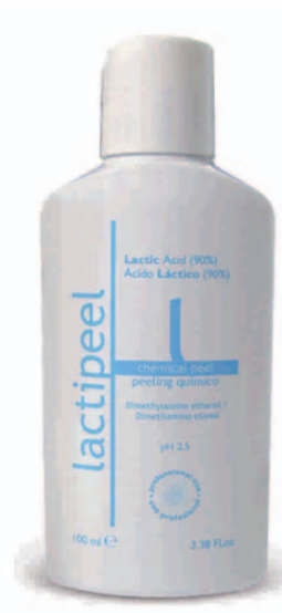
PRESENTATION 100 ml.

Formulated in a gel texture that makes the acid slowly penetrates the skin diminishing the irritation of the lactic acid.