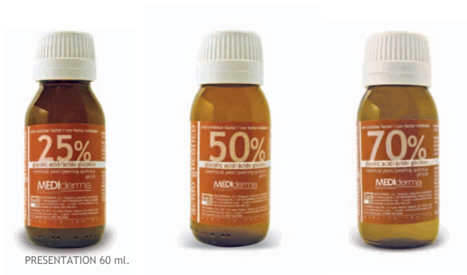
PRESENTATION 60 ml.