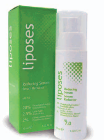
PRESENTATION 30 ml

The complex reduces eye bags and dark circles, and favors the drainage of fluid. It improves elasticity and permeability of blood vessels, reduces the effects of free radicals and decreases inflammation. Boswellia serrata extract contains boswellic acids. These acids are known for their soothing and decongestant action.