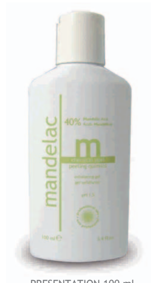
PRESENTATION 100 ml.