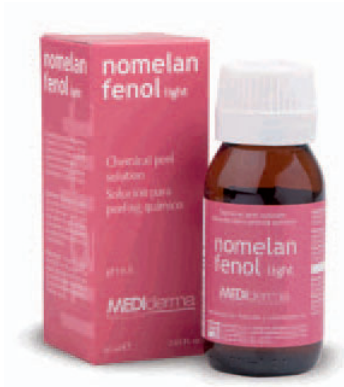
PRESENTATION 60 ml.