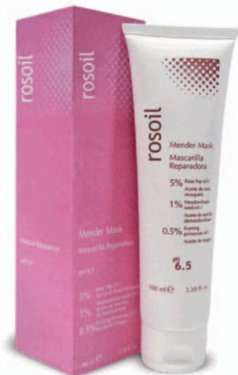
PRESENTATION 100 ml.