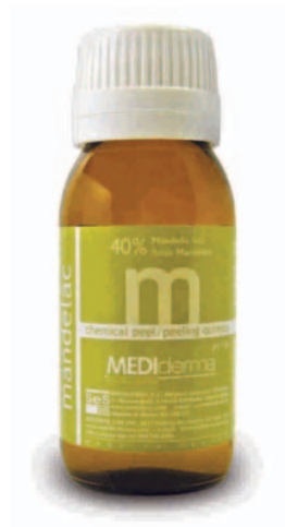
PRESENTATION 60 ml.