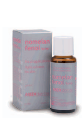
PRESENTATION 20 ml.

Indications Skin aging (wrinkles, loss of skin firmness and density, lack of brightness...), acne scars and stretch marks.