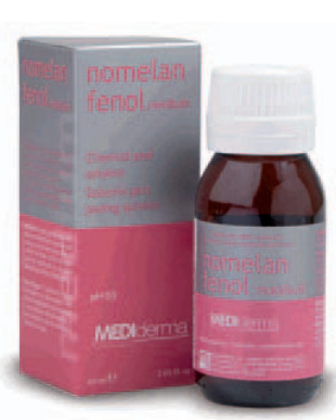
PRESENTATION 60 ml.

Indications Superficial wrinkles and acne.