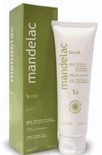
PRESENTATION 100 ml

The shea butter possesses a high content of unsaturated fatty acids (linoleic, oleic, palmitic and stearic acid) which confer an excellent skin compatibility. Protects the skin from external aggressions and favors the skin regeneration. Besides, possesses smoothing, hydrating, emollient and anti-irritating properties.