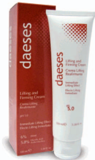
PRESENTATION 100 ml