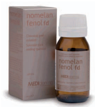
PRESENTATION 60 ml.