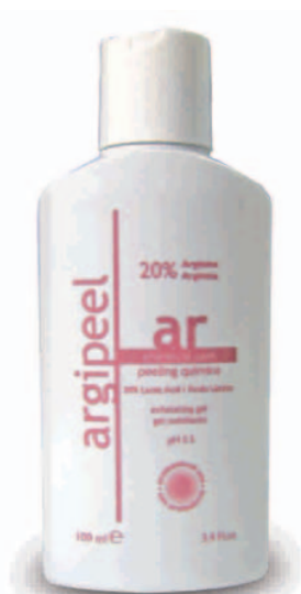
PRESENTATION 100 mL.

Arginine is an amino acid derived from the fermentation and purification of plant carbohydrates (sugar cane). It has a large molecule and therefore its penetration through the stratum corneum is very slowly, thus avoiding any irritation. Combined with the lactic acid, it gains all of the benefits of alpha hydroxy acids (exfoliating properties, increases cell regeneration, improves skin firmness, diminishes hiper pigmentations...) without itching, stinging or burning.