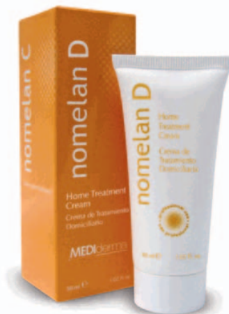
PRESENTATION 30 ml

Moisturizes, repairs the skin and strengthens the activity of the lipid barrier to support and retain water.