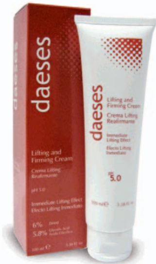
PRESENTATION 100 ml