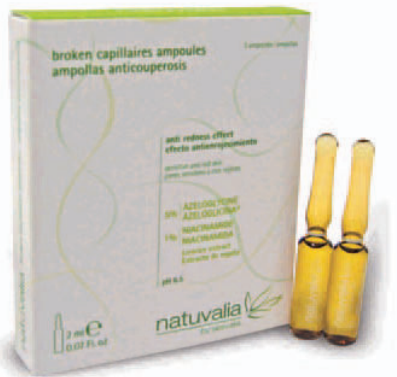
PRESENTATION 2 ml.

The Natuvalia cosmetic ampoules line is characterized by a high concentrations of active ingredients. They are developed to be incorporated easily into their daily treatments and strengthen results.