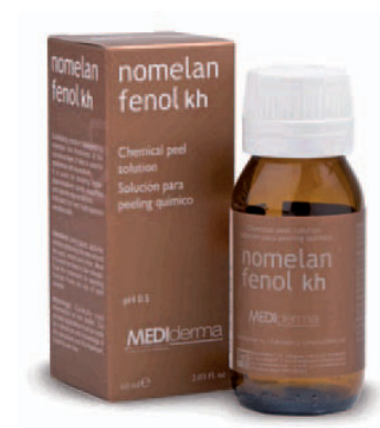
PRESENTATION 60 ml.

Indications Designed for localized applications.