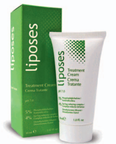
PRESENTATION 30 ml

It contains DMAE, a nutrient that fights the signs of aging skin instantly. It improves the shape and firmness of the face and the order jaw area(reaffirming action). Stimulates muscle activity producing stretching with a lifting effect (tensing effect), increases skin elasticity, reduces wrinkles and stabilizes cell membranes to repair the damage caused by free radicals in collagen (antioxidant effect). Produces filler effect, more shaped lips.