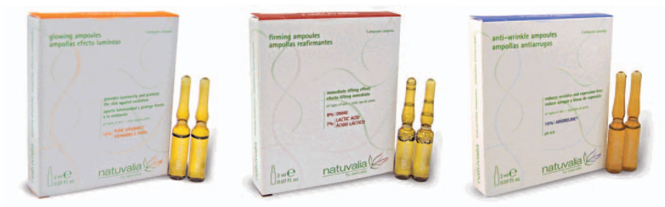
PRESENTATION 2 ml.