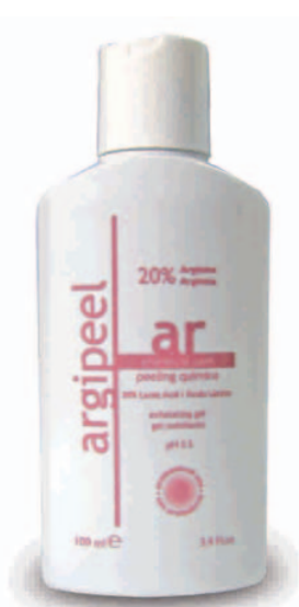
PRESENTATION 100 ml.

Arginine is an amino acid derived from the fermentation and purification of plant carbohydrates (sugar cane). It has a large molecule and therefore its penetration through the stratum corneum is very slowly, thus avoiding any irritation. Combined with the lactic acid, it gains all of the benefits of alpha hydroxy acids (exfoliating properties, increases cell regeneration, improves skin firmness, diminishes hiper pigmentations...) without itching, stinging or burning.