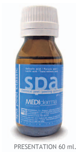
PRESENTATION 60 mL.