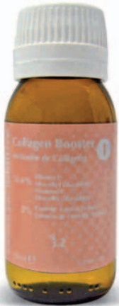
PRESENTATION 50 ml.

Collagen booster additives contain active ingredients that protect and regenerate the dermal matrix to stimulate fibroblasts to synthesize molecules of the connective tissue, especially collagen, fibronectin and GAGs, thereby improving the firmness of the skin and reducing wrinkles.