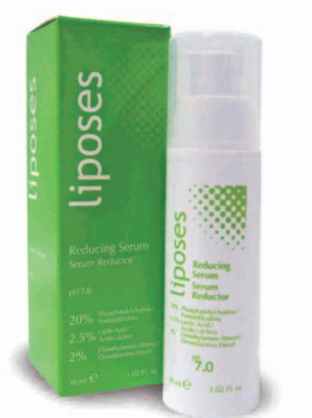
PRESENTATION 30 ml

The complex reduces eye bags and dark circles, and favors the drainage of fluid. It improves elasticity and permeability of blood vessels, reduces the effects of free radicals and decreases inflammation. Boswellia serrata extract contains boswellic acids. These acids are known for their soothing and decongestant action.