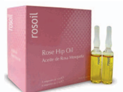
PRESENTATION 6 ampoules 3 ml

Purifying (mandelic acid and chlorhexidine) and abrasive effect: the micro-spheres of polyethylene eliminate dead cells, unclog pores, and leave the skin impurity-free. Mandelic acid combines the effects of glycolic acid and salicylic acid. However, it is less irritating and controls sebum secretion. Calming and refreshing actions (aloe and chamomile): reduces the irritant component related to oily and acne prone skin.