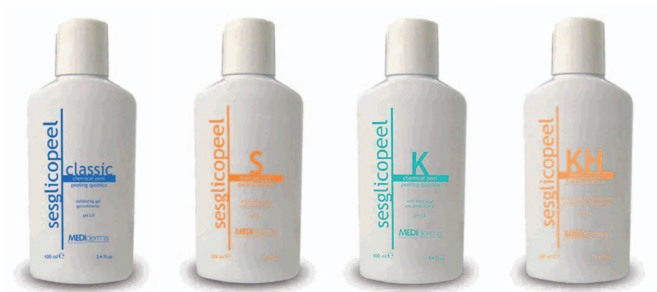
PRESENTATION 100 ml.