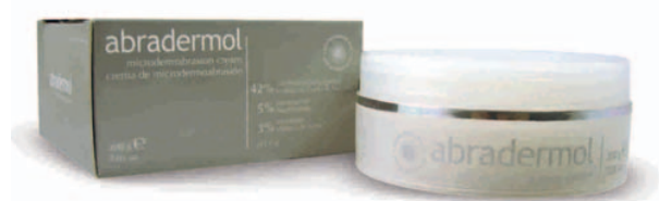
PRESENTATION 200 g