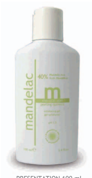
PRESENTATION 100 mL.