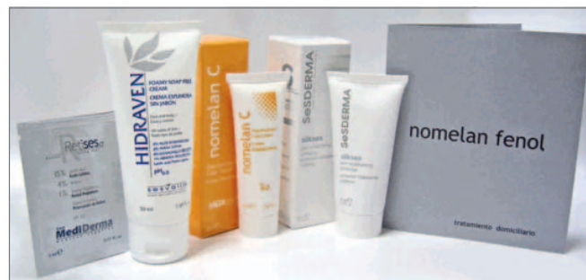
Home Pack Nomenal Fenol