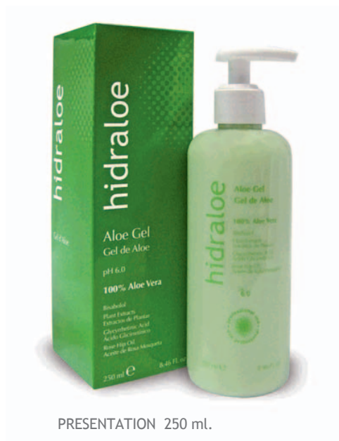
PRESENTATION 250 ml.