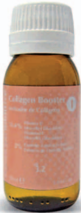
PRESENTATION 50 mL.

Collagen booster additives contain active ingredients that protect and regenerate the dermal matrix to stimulate fibroblasts to synthesize molecules of the connective tissue, especially collagen, fibronectin and GAGs, thereby improving the firmness of the skin and reducing wrinkles.