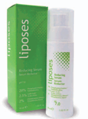
PRESENTATION 30 ml

The complex reduces eye bags and dark circles, and favors the drainage of fluid. It improves elasticity and permeability of blood vessels, reduces the effects of free radicals and decreases inflammation. Boswellia serrata extract contains boswellic acids. These acids are known for their soothing and decongestant action.