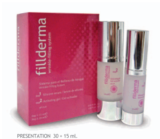
PRESENTATION 30 + 15 ml.

Rose clay mask which contains active ingredients with hydrating, smoothing, calming and repairing properties. Ideal after aggressive treatment ( chemical peels or microdermoabrasions) since it provides high level of AGEs for the skin, the vital constituents of the cell membranes, responsible for the skin regeneration action.