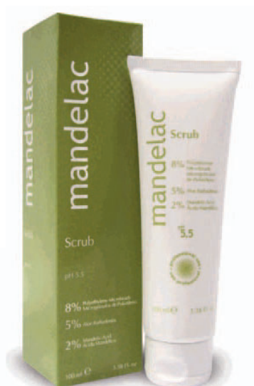
PRESENTATION 100 ml

The shea butter possesses a high content of unsaturated fatty acids (linoleic, oleic, palmitic and stearic acid) which confer an excellent skin compatibility. Protects the skin from external aggressions and favors the skin regeneration. Besides, possesses smoothing, hydrating, emollient and anti-irritating properties.