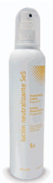
PRESENTATION 200 ml.

Strontium chloride inhibits a burning sensation, irritation and itching properties of AHA's. It inhibits erythema and reduces epidermolysis. Niacinamide increases the barrier effect on the skin, protecting it from environmental factors. Reduces facial erythema and possesses a potent anti-inflammatory action. The complex is made up of assets with moisturizing, anti-inflammatory and soothing properties.