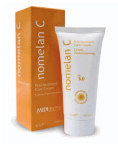
PRESENTATION 30 ml