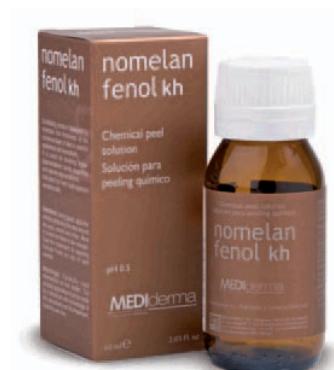
PRESENTATION 60 ml.

Indications Designed for localized applications.