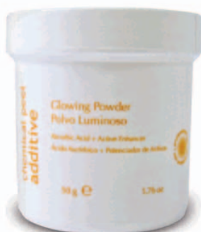
PRESENTATION 50 g.

Additives are products designed to be combined with chemical peelings, with the aim of contributing to the pure active ingredients to enhance the results of chemical peels.