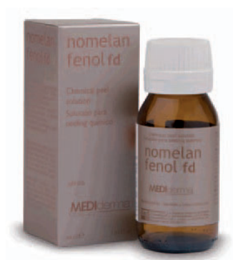
PRESENTATION 60 ml.