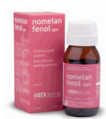
PRESENTATION 60 ml.