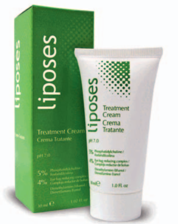
PRESENTATION 30 ml

It contains DMAE, a nutrient that fights the signs of aging skin instantly. It improves the shape and firmness of the face and the jaw area (reaffirming action). Stimulates muscle activity producing stretching with a lifting effect (tensing effect), increases skin elasticity, reduces wrinkles and stabilizes cell membranes to repair the damage caused by free radicals in collagen (antioxidant effect). Produces filler effect, more shaped lips.