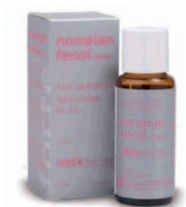
PRESENTATION 20 ml.

Indications Skin aging (wrinkles, loss of skin firmness and density, lack of brightness...), acne scars and stretch marks.