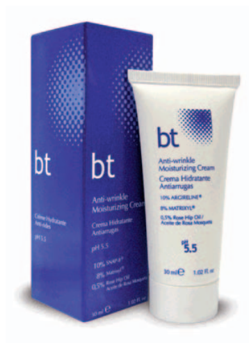
PRESENTATION 30 ml

Stimulates and boosts cutaneous regeneration (aloe, allantoin and rose hip oil).