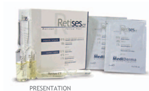
PRESENTATION 6 ampoules of 2ml 6 packs of 5ml

The chemical peel is combinable with other anti aging repairer or de-pigmentation treatments. (Chemical peels, laser, IPL ...).