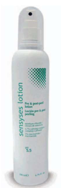
PRESENTATION 200 ml.

Tonic lotion with glycolic acid, moisturizing and astringents agents (water Hamamelis). Removes makeup residues that remain after the application of cleansing lotions. Notable degreasing action, useful in the cleaning and hygiene of greasy skin with a tendency to have impurities. Ideal for degreasing the facial skin that will be subjected to chemical peels and favouring the penetration of other agents that are usually used for wrinkles, acne and facial blemishes.