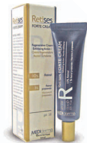
PRESENTATION Tube of 15ml

Apply 1 / 2 or 1 ampoule of Vitamin C and wait a few minutes. Apply a thin layer of the retinol cream on the area being treated. Let it work for about 8 hours. Wash the treated area.