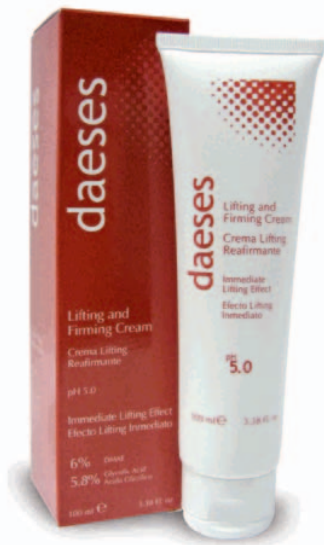
PRESENTATION 100 ml

Composition 6% DMAE and 5.7% Glycolic acid.