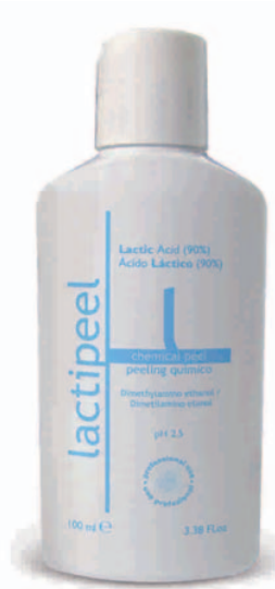
PRESENTATION 100 mL.

Formulated in a gel texture that makes the acid slowly penetrates the skin diminishing the irritation of the lactic acid.