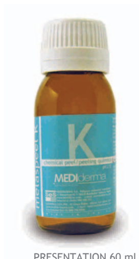
PRESENTATION 60 mL.