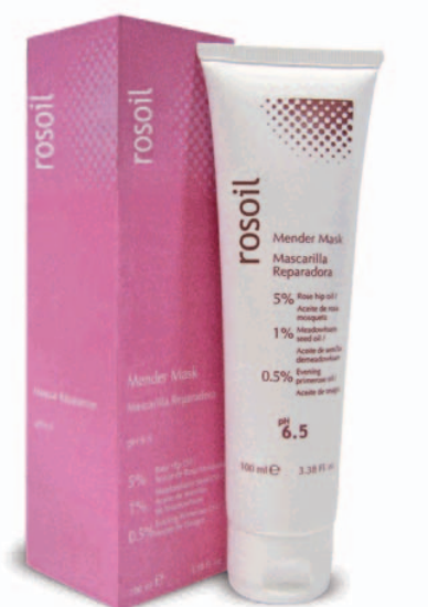
PRESENTATION 100 ml.