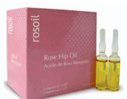
PRESENTATION 6 ampoules 3 ml

Purifying (mandelic acid and chlorhexidine) and abrasive effect: the micro-spheres of polyethylene eliminate dead cells, unclog pores, and leave the skin impurity-free. Mandelic acid combines the effects of glycolic acid and salicylic acid. However, it is less irritating and controls sebum secretion. Calming and refreshing actions (aloe and chamomile): reduces the irritant component related to oily and acne prone skin.