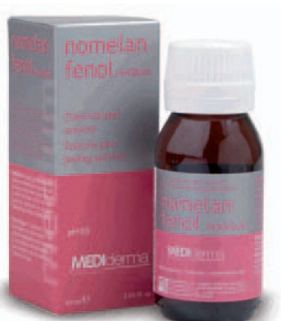
PRESENTATION 60 ml.

Indications Superficial wrinkles and acne.