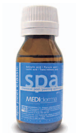
PRESENTATION 60 mL.