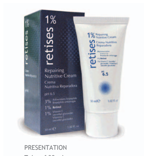
PRESENTATION Tube of 30 ml

Apply to the treatment area or specific lesion. Let it work for about 8 hours. Wash the treated area.