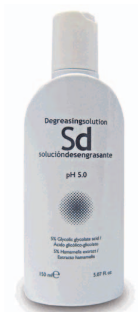
PRESENTATION 150 ml.