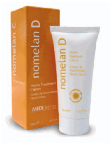
PRESENTATION 30 ml

Moisturizes, repairs the skin and strengthens the activity of the lipid barrier to support and retain water.