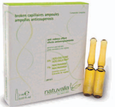
PRESENTATION 2 mL.

The Natuvalia cosmetic ampoules line is characterized by a high concentrations of active ingredients. They are developed to be incorporated easily into their daily treatments and strengthen results.