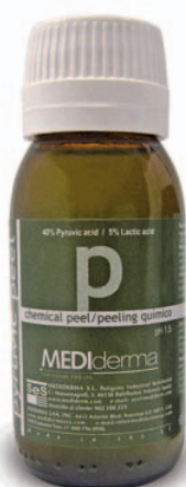
PRESENTATION 60 mL.

After implementation, it is normal for a mild erythema to appear, which will go away after a few hours.