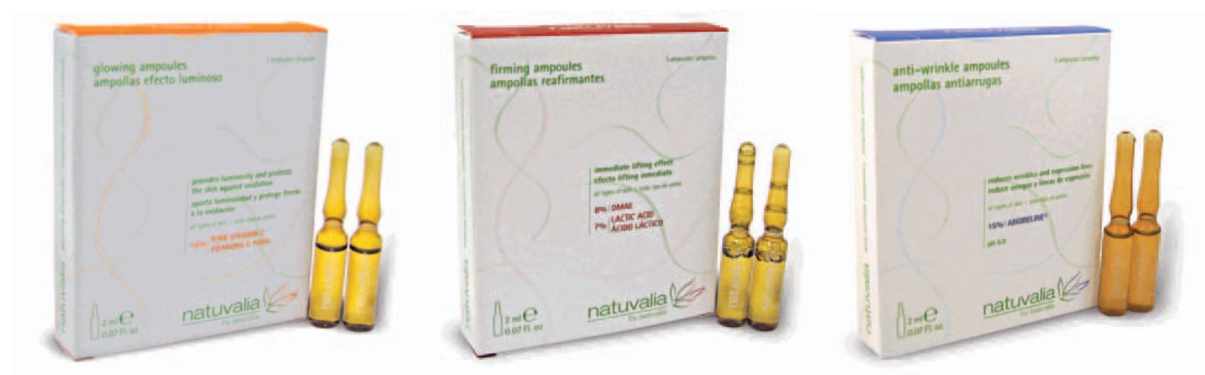
PRESENTATION 2 ml.