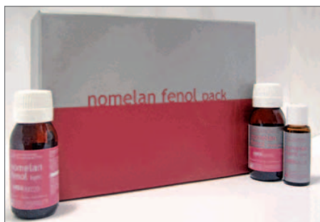
Nomenal Fenol Pack