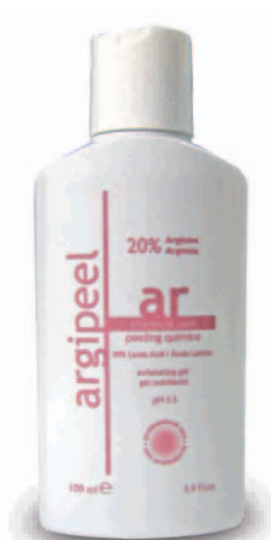
PRESENTATION 100 mL.

Arginine is an amino acid derived from the fermentation and purification of plant carbohydrates (sugar cane). It has a large molecule and therefore its penetration through the stratum corneum is very slowly, thus avoiding any irritation. Combined with the lactic acid, it gains all of the benefits of alpha hydroxy acids (exfoliating properties, increases cell regeneration, improves skin firmness, diminishes hiper pigmentations...) without itching, stinging or burning.