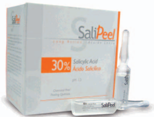
PRESENTATION 6 ampoules 3 ml.

It is a safe chemical peel that does not carry risk of burns, especially with the formulas that have hydro alcoholic vehicles, because they evaporate quickly and after the crystallization or drying, there is no further penetration of active agents. All chemical peels within this family contain salicylic acid between 25-30 % and a pH between 1.5 and 2.0.