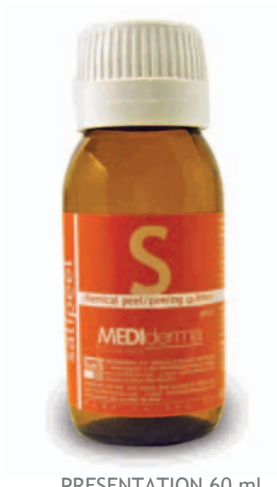
PRESENTATION 60 ml.